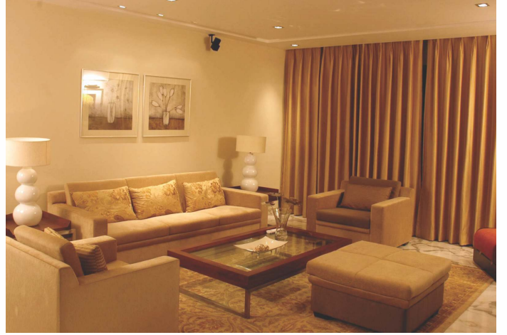
Living Room: Soham, Walkeshwar