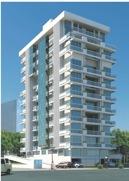
CHITRA West Avenue, Santacruz (W)