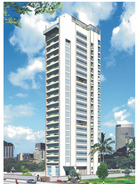
SOHAM APARTMENTS Teen Batti, Walkeshwar