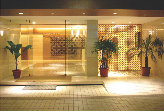
Entrance Lobby: Chitra, Santacruz (W)