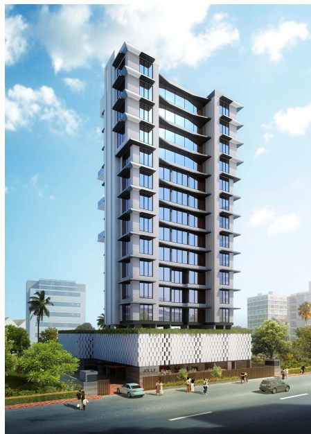
JOLLY FRIENDS 15th Road, Bandra (W)